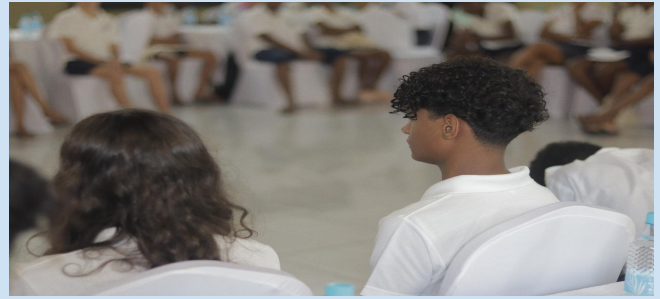
First-Ever Inner Island Children's Conference

The next day, the NCC team proudly hosted its first Inner Island Children's Conference at the Baie Ste. Anne Community Centre. The event brought together 67 children from Grand Anse, Vijay International School, and La Digue Schools for a day of learning, empowerment, and dialogue.