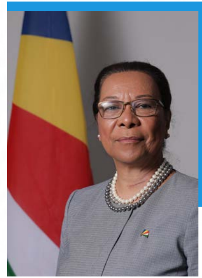
Minister Peggy Vidot

As we gradually emerge from three long years of the debilitating COVID-19 pandemic, which has left indisputable after effects on the physical and mental health of our communities, we are compelled to cast a closer look at the health of our nation and the health system designed to promote, protect and restore health. READ MORE